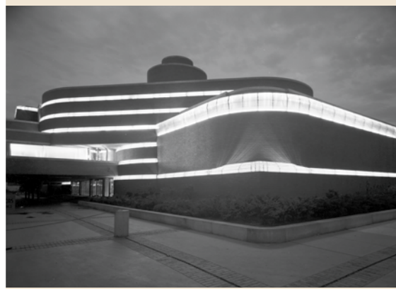
Johnson Wax headquarters, Racine, Wisconsin