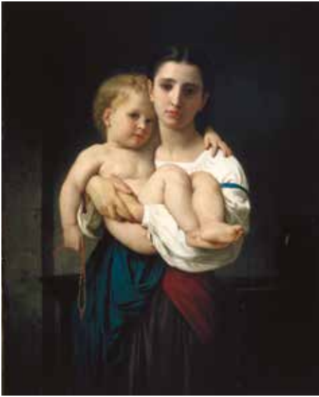
William Bouguereau (French, 1825–1905). The Elder Sister , reduction (La soeur aînée, réduction), ca. 1864, oil on panel, 21 7/8 x 17 15/16 in. (55.6 x 45.6 cm). Brooklyn Museum, Bequest of William H. Herriman, 21.99