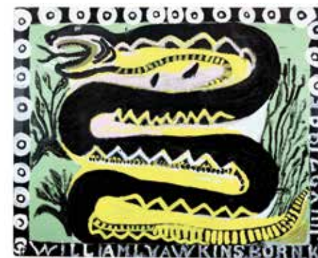
William L. Hawkins, Rattlesnake #3 , 1988, enamel and collage on Masonite, 48 x 60 inches, Private Collection, Princeton, IL

Drawn from important public and private collections across the United States and Europe, William L. Hawkins: An Imaginative Geography includes 52 of Hawkins's most important paintings, some well-known pieces and others rarely seen. The exhibition covers all of Hawkins's favorite subject matter, including cityscapes, landscapes, exotic places, animals, current events, historic scenes and religious scenes. The exhibition also will include one of his rare freestanding sculptural assemblages. Organized by the Figge Art Museum, the exhibition is accompanied by a 192-page catalogue with essays by Susan M. Crawley, Jenifer P. Borum, Curlee R. Holton and others.