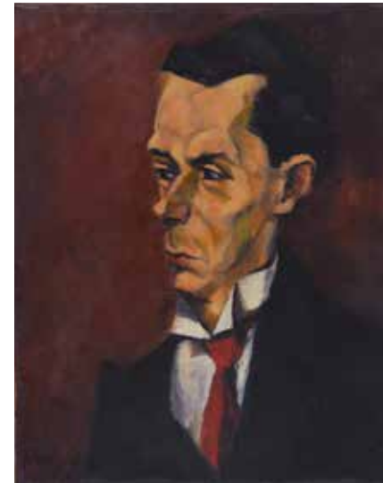
Lajos Tihanyi (Hungarian, 1885–1938), The Critic , 1916, oil on canvas, 20 1/8 x 16 3/8 in. (51.1 x 41.6 cm) Brooklyn Museum, Gift of the Right Reverend John Torok, D.D., 29.1302

Celebrate French art and culture in this program designed for K–12 students and their families. Participants will be able to "meet" an artist in a living museum, grind their own paint, create poetry, enjoy artworks and more!