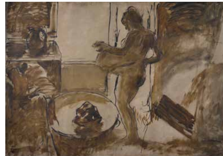
Edgar Degas (French, 1834-1917), Nude Woman Drying Herself, circa 1884-86, oil on canvas, 59 3/8 x 84 1/8 in. (150.8 x 213.7 cm), Brooklyn Museum, Carl H. de Silver Fund, 31.813

Location: Bettendorf Public Library, 2950 Learning Campus Dr., Bettendorf, IA Patrons of all ages are invited to attend a feature film, based on a classic children's book by Ludwig Bemelmans about the schoolgirl adventures of an orphan named Madeline in Paris, France. The film is rated PG. For more information, visit www.bettendorflibrary.org .