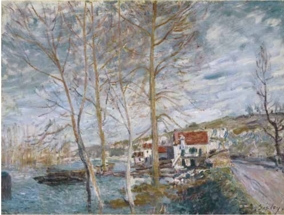
Alfred Sisley (British, active France, 1839–1899), Flood at Moret , 1879, oil on canvas, 21 1/4 x 28 1/4 in. (54 x 71.8cm), Brooklyn Museum, Bequest of A. Augustus Healy, 21.54