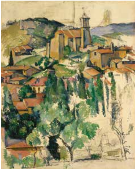
Paul Cézanne (French, 1839–1906), The Village of Gardanne , 1885–86, oil and conté crayon on canvas, 36 1/4 x 28 13/16 in. (92.1 x 73.2 cm), Brooklyn Museum, Ella C. Woodward Memorial Fund and Alfred T. White Fund, 23.105