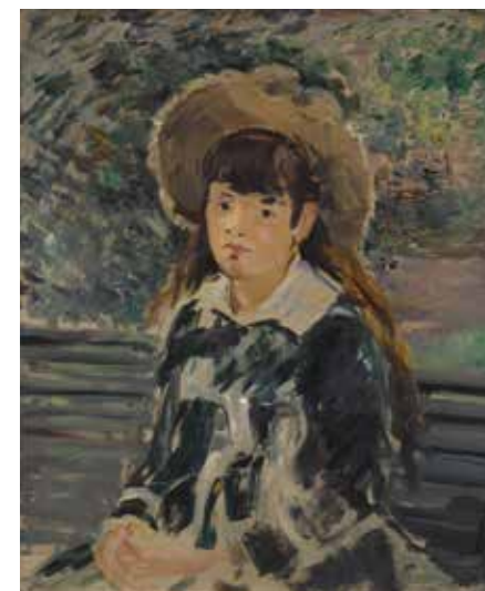
Édouard Manet (French, 1832-1883) Young Girl on a Bench (Fille sur un Banc), 1880, oil on canvas, 29 1/2 x 24 in. (97.2 x 83.8cm), Brooklyn Museum, Collection of The Rita and Alex Hillman Foundation, L2009.5.9